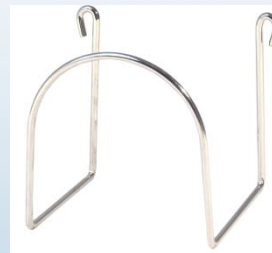
VM166 - Metal Hose Rack