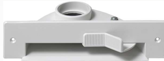
VPAN Automatic Dust Pan