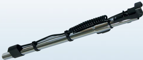
VMTC Metal Telescopic Wand w/High Voltage Cord