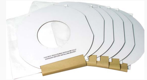
VMP600-6 Disposable Vacuum Bags