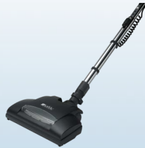
VM179B – 12" Air Driven Turbo Carpet Brush