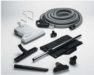
VM1200DS – Air Driven Turbo System Package

Linear has a large assortment of accessories to choose from to customize your Vacuum System (not all products shown here) .