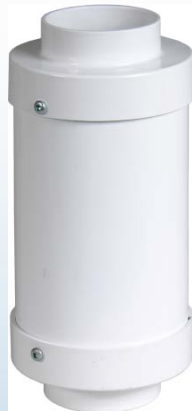
VMMUFS Noise Reducing Exhaust Muffler