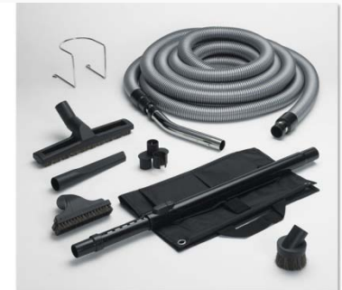
VMGAR – Deluxe Garage/Car Tool Kit