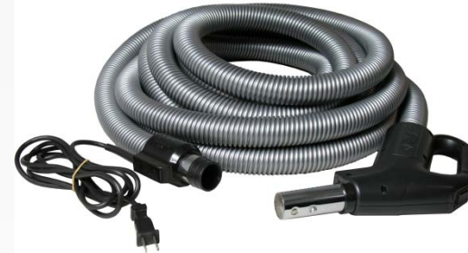
VM510PS - Deluxe Hose