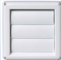
VM136 Exhaust Vent Cap