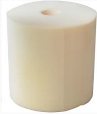
VM601 Secondary Foam Filter