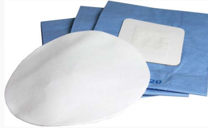
VM505 Disposable Bags & Filter