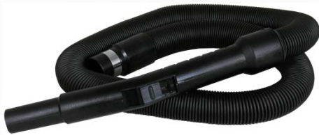
V361 - "Slinky" Hose