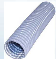
VM123 Flexible Hose