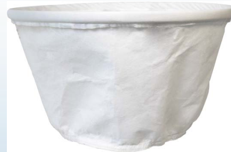
226177 Filter Bag