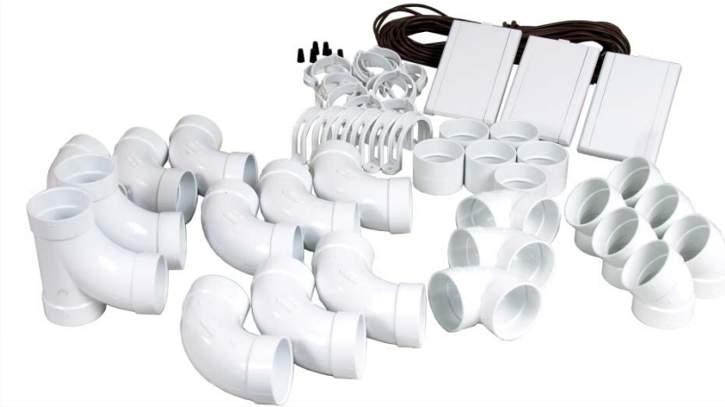
VM3VK – 3-Wall Inlet Valve Kit