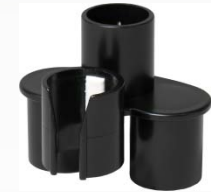
VM258 On-Board Tool Caddy