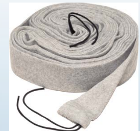
VM204 Fabric Hose Cover