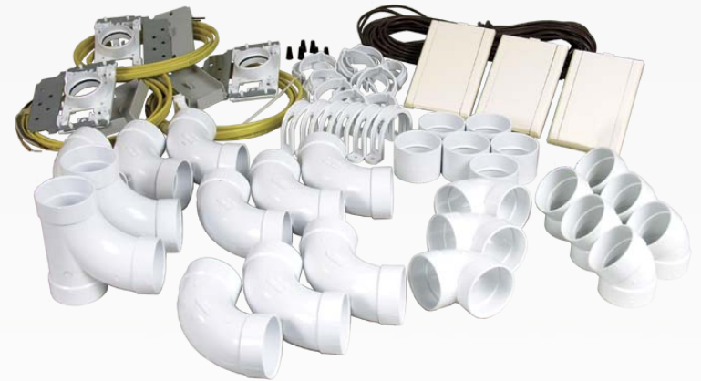
VMVP3K 3-Wall High-Voltage Inlet Valve Kit