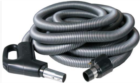
V610PS - Deluxe SuperSystem Hose