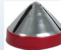
VM186 Pipe Reamer