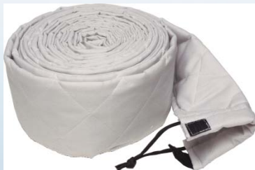
VM700 Deluxe Padded Fabric Hose Cover