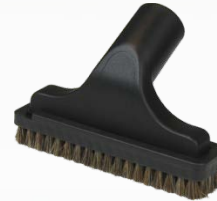
VM256 Upholstery Tool