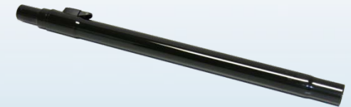
VMTEP Plastic Telescopic Wand