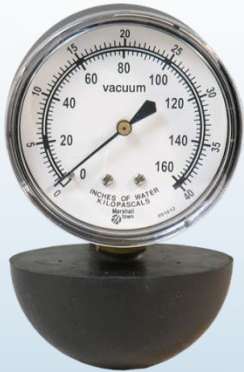
VM181 Vacuum Gauge