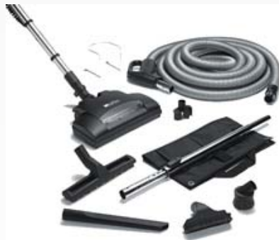
VM4200DS – Deluxe SuperSystem Package