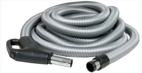
VM410 - Central Vacuum Hose